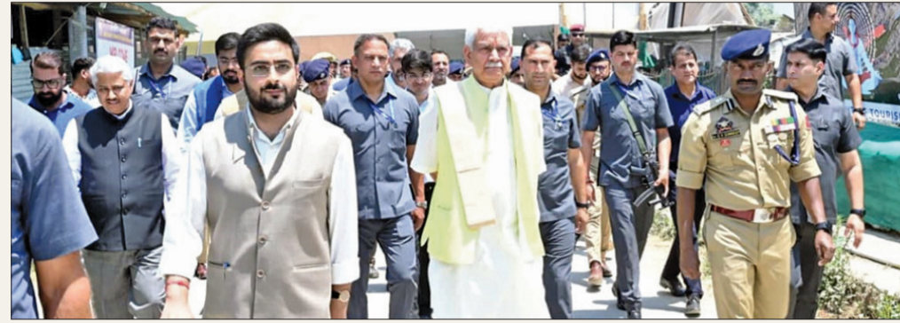
GMK NEWS NETWORK

Visits Pantha Chowk Yatra Transit Camp, Yatri Niwas; Orders Round-The-Clock Care For Pilgrims