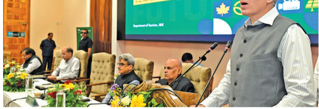
GMK NEWS NETWORK

Says Need To Develop J&K As A Sustainable Tourism Destination