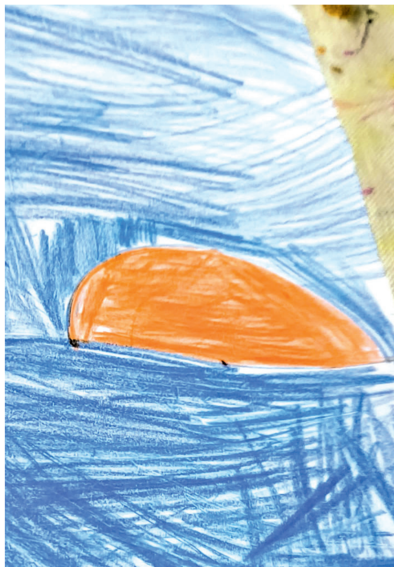
Sun setting over a beach

Queiroz was only appointed Ghana coach in April after Otto Addo was sacked following a run of defeats. In addition to the four games in the World Cup, he was also in charge of Ghana's 2-0 defeat to Mexico and a 1-1 draw with Wales.