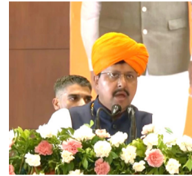
BJP national president in Jammu this year.

JAMMU: Bharatiya Janata Party national president Nitin Nabin on Monday asserted that J&K people "got their real freedom in 2019 when the Prime Minister Narendra Modi abrogated Article 370 and 35-A, realising the vision of Dr Syama Prasad Mookerjee."