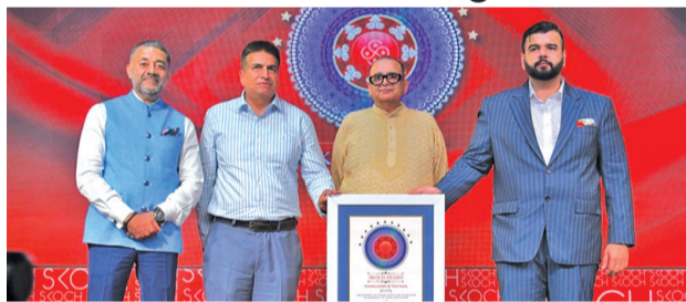
GMK NEWS NETWORK

SRINAGAR: Department of Handicrafts and Handloom, Kashmir, has been conferred with the prestigious SKOCH Award for its innovative GI QR Code Management System, implemented through the Pashmina Testing & Quality Certification Centre (PTQCC) at the Craft Development Institute (CDI) and the NABL-accredited Carpet Testing Laboratory at IICT, Srinagar. The award recognizes the Department's pioneering use of technology to strengthen product authenticity, quality assurance, sustainability and artisan welfare in the handicrafts sector.