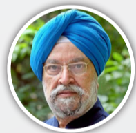
HARDEEP SINGH PURI

On 10 June, Prime Minister Narendra Modi becomes the longest continuously serving democratically elected Prime Minister in our history. Having served the Indian state across much of the journey in between, I can say the achievement is not the length of the tenure. It is what the office has been made to do.