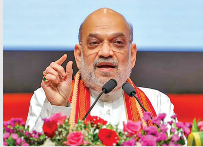
structure beyond its borders.

He termed surgical strikes, air strikes and Operation Sindoor as examples of India's willingness to target terrorist infra-