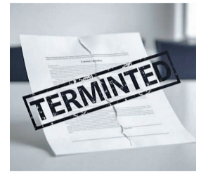
GMK NEWS NETWORK

SRINAGAR: The Jammu and Kashmir Government has terminated the services of a Power Development Department (PDD) employee over alleged involvement in terror-related activities.