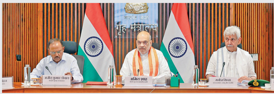
GMK NEWS NETWORK

Chairs High-Level Meet In Delhi, Says Pilgrim Safety Top Priority Of PM Modi-Led Govt