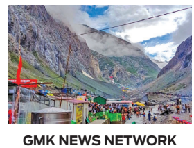
GMK NEWS NETWORK