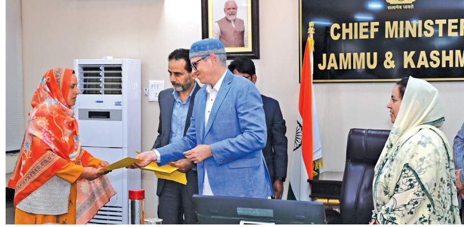
GMK NEWS NETWORK

Says employees should work with sincerity, dedication for betterment of Deptt