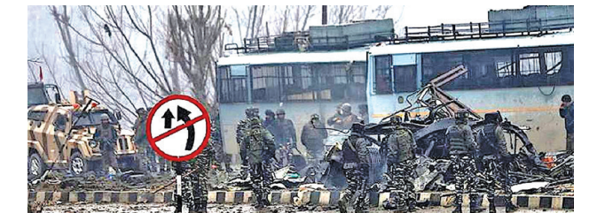
GMK NEWS NETWORK

NEW DELHI: Hamza Burhan, one of the alleged masterminds behind the 2019 Pulwama terror attack, has reportedly been shot dead by unidentified gunmen in Muzaffarabad, located in Pakistan-occupied Kashmir (PoK).