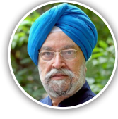
HARDEEP SINGH PURI