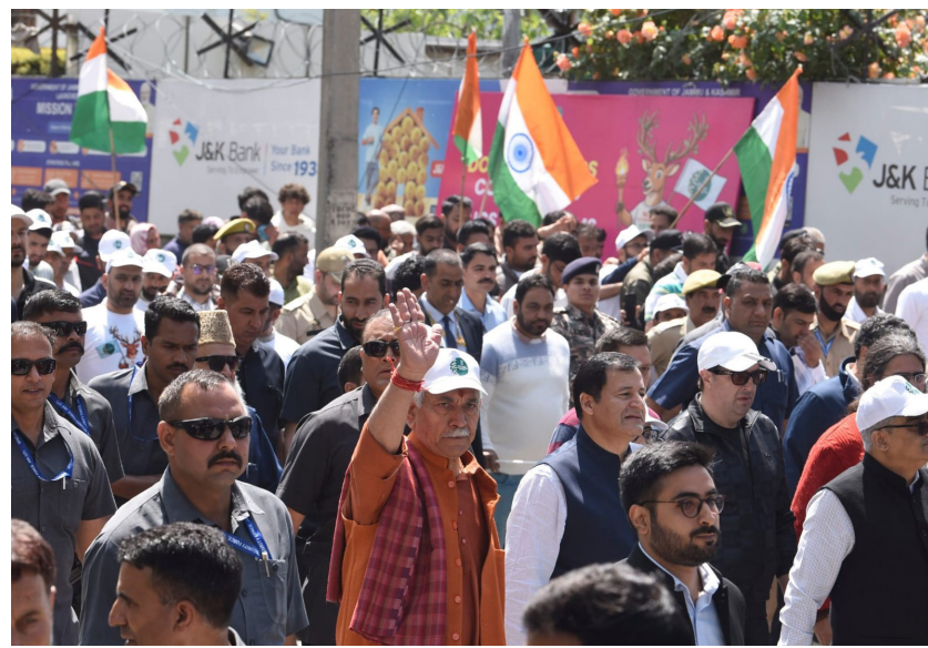
Governor Manoj Sinha has brought to this fight. This is not an exaggeration it is a fact that the people of J&K are witnessing with their own eyes.

On April 11, 2026, LG Sinha did not issue a press release. He did not chair a committee meeting. He walked. Leading a massive anti-drug padyatra from Maulana Azad Stadium in Jammu, he launched the historic 100-Day "Nasha Mukta J&K Abhiyan" placing his own feet on the ground as the first and most visible soldier of this campaign.