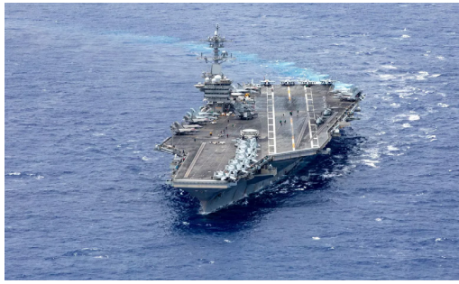
Joint Chiefs Chairman Air Force Gen. Dan Caine said Iran had "repeatedly threatened and attacked commercial shipping"

According to the Pentagon, more than 22,500 mariners aboard over 1,550 commercial vessels remain stranded in the region as a result of Iranian actions.