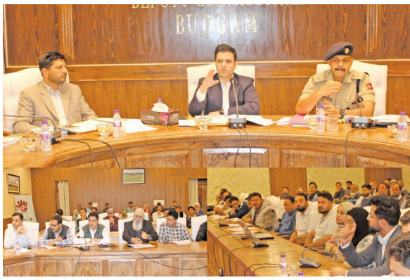
The DC reiterated that 100% CCTV coverage and Computerised Billing Systems (CBS) must be ensured in all chemist shops, with regular inspections and strict action against violations.

On the occasion, the DC directed all line departments to intensify efforts against narcotics cultivation and peddling. He emphasised ensuring that roadsides, embankments, and other vulnerable areas remain free from cannabis and poppy cultivation through coordinated