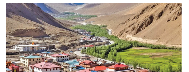
GMK NEWS NETWORK

JAMMU: Ahead of Union Home Minister Amit Shah's visit to Ladakh, the administration of the Union Territory on Monday created five new districts, taking the total number of districts in the UT to seven. In a post on X, LG of Ladakh, Vinai Kumar Saxena, announced the creation of five new districts. "A historic day for Ladakh. I have approved the notification for the creation of five new districts in Ladakh, fulfilling the aspirations and long-pending demand of the people of Ladakh," the LG