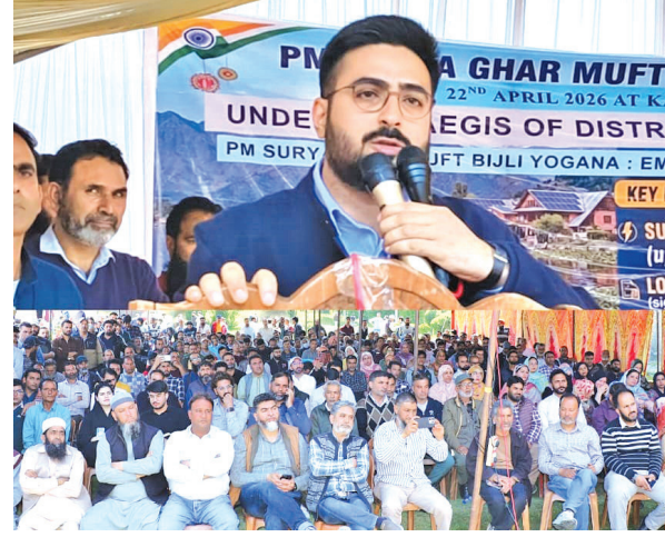
KPDC Officers, scheme vendors and technical experts.