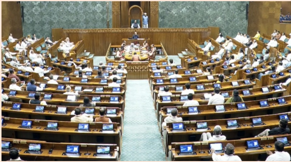
cal confrontation, with the NDA accusing the INDIA bloc of deliberately block-

The defeat of the Bill has triggered a sharp political