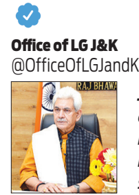
Office of LG J&K @OfficeOfLGJandK

J&K Police has been instrumental in forging a terror-free, crime-free UT where no insecurity overshadows civilian lives. The force has played a pivotal role in achieving remarkable milestones in good governance, innovation, social unity, and building a just society.