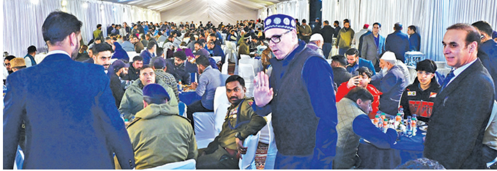
Speaking on the occasion, the Chief Minister extended his warm greetings to the