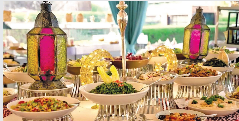
REHAN QAYOOM MIR

Restaurants, Cafes Roll Out Traditional Platters As Families Throng Eateries For Evening Meals