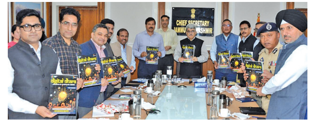
GMK NEWS NETWORK

CS Engages Key Stakeholders To Chart Future Roadmap