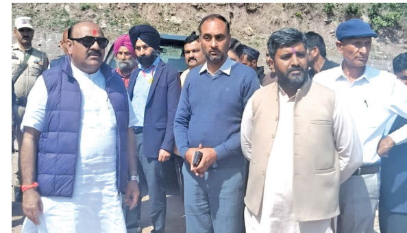
the National Bank for Agriculture and Rural Development funded scheme. He stressed that the bridge is a vital connectivity project for the area and directed the executing agency to maintain the quality standards while accelerating

During the visit, the Deputy Chief Minister reviewed the status of construction works and interacted with the concerned officers and engineers executing the project under