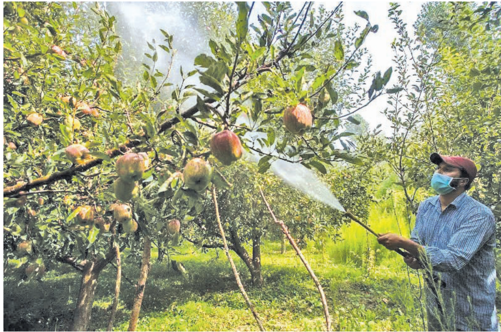
despite investing heavily in sprays and treatments, they fail to achieve desired results

due to poor-quality products. "We spend thousands on sprays every season. If the pesticide