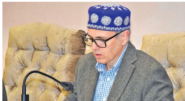
GMK NEWS NETWORK

Participants Offers Prayers; Urge People To Maintain Peace, Brotherhood