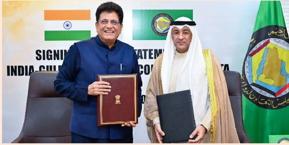
signed the Terms of Reference for a Free Trade Agreement (FTA) in November. Subsequent

more resilient and globally integrated," said the statement. Notably, several major economies are currently engaged in active negotiations with India to deepen trade and investment ties through FTAs and comprehensive economic partnerships. India reached a framework understanding with the United States in February for an Interim Agreement aimed at promoting reciprocal and mutually beneficial trade. The framework reaffirms the countries' commitment to the broader US-India Bilateral Trade Agreement (BTA) negotiations, which will include additional market access commitments and support more resilient supply chains. Moreover, India and Israel