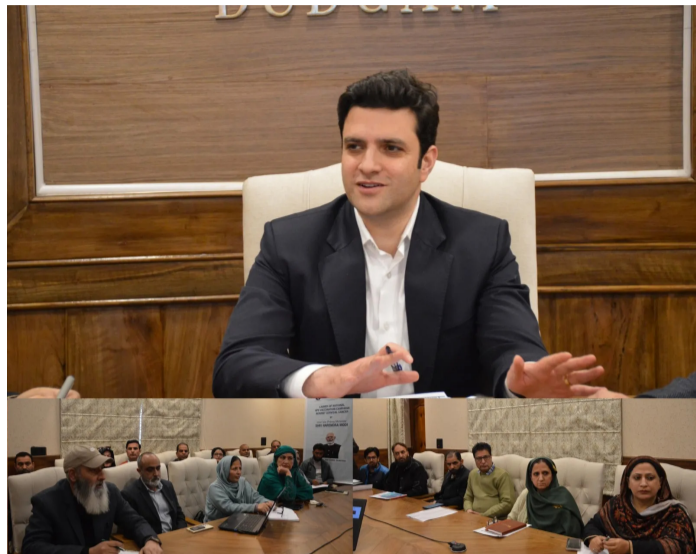
only at designated government health facilities with adequate

He emphasised that vaccination sessions shall be conducted