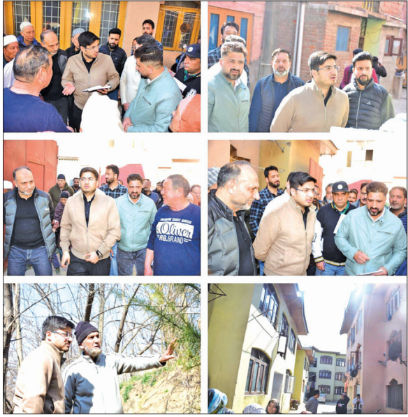
improved operational efficiency, and prompt resolution of civic grievances raised by residents.

During his visit to Tibetan Colony, Eidgah, the Commissioner undertook a comprehensive review of municipal infrastructure, including sanitation arrangements, drainage networks, and waste management operations. He evaluated the performance of field-level services and directed concerned officials to ensure sustained cleanliness,