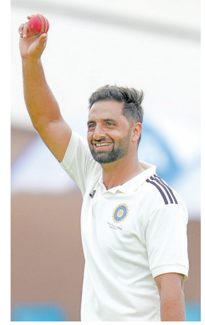
winning the domestic tournament that matters the most to get into the national side," he wrote. "Fitness across the