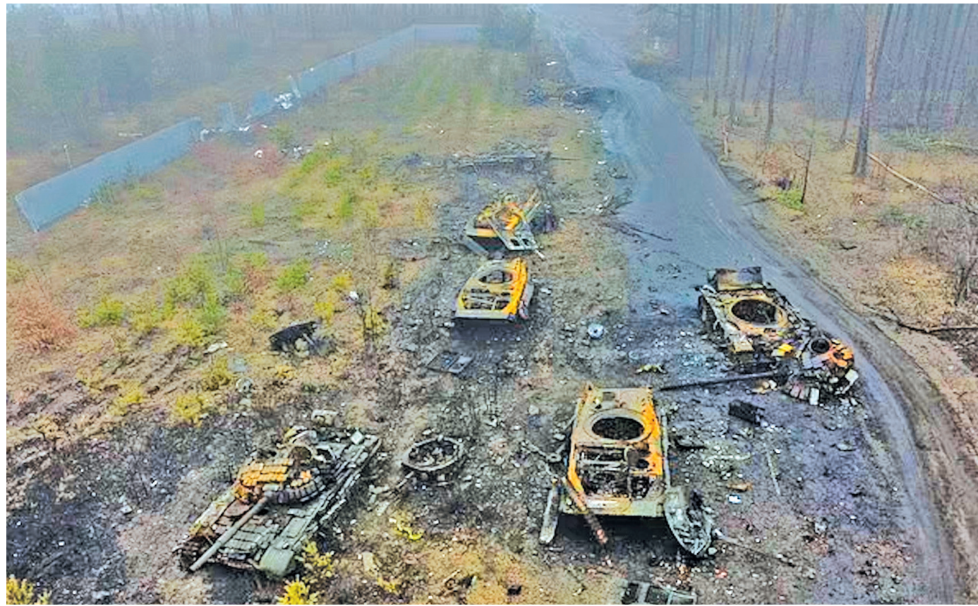
of Suvorovo and Nikanorovka in Donetsk over the past 24 hours, Russia's state-owned news agency TASS reported. According to the report, Russian air defence systems have

Amid the ongoing conflict with Ukraine, Russian military units liberated the settlements