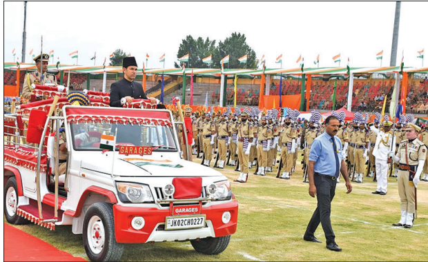
GMK NEWS NETWORK

SRINAGAR: In a vibrant display of patriotism and unity, full-dress rehearsals for the upcoming 79th Independence Day celebrations unfolded today across Kashmir. The rehearsals held at all district headquarters marked the culmination of weeks of preparation, offering a glimpse into the grand festivities set to light up the Valley on August 15. On the occasion, heartfelt tributes were paid to the nation's leaders, freedom fighters, and martyrs whose sacrifices paved the way for India's independence. Their unwavering dedication was honored as the foundation of the freedom enjoyed by the country today. At Srinagar, Divisional Commissioner (Div Com) Kashmir, Vijay Kumar Bidhuri hoisted the National Flag at Bakshi Stadium, inspected the parade contingents, took salute at March past and addressed the participants.