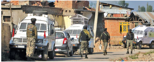
GMK NEWS NETWORK

SRINAGAR: Counter Intelligence Kashmir (CIK) on Saturday conducted searches at ten locations across four districts of Jammu and Kashmir, linked to a terror case under NIA Act.