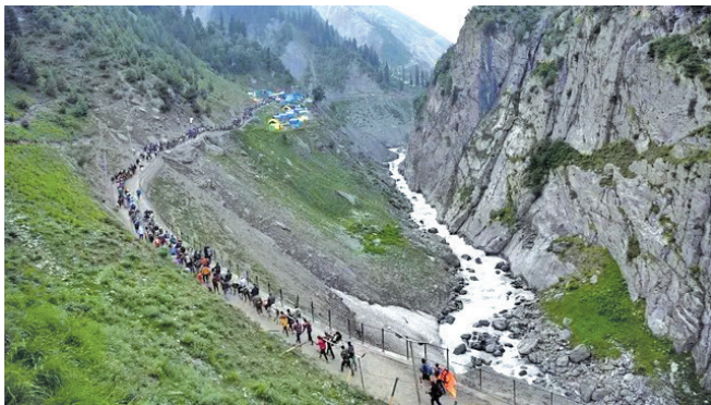
UMAISAR GULL GANIE

7th batch of 7,541 pilgrims leaves from Jammu