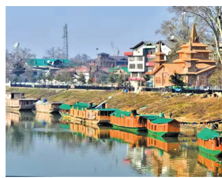
REHAN QAYOOM MIR

SRINAGAR: Despite a brief spell of rainfall plummeting the maximum temperatures in central Kashmir on Monday, the water level in River Jhelum has shown "only a marginal rise," while the water scarcity continues to grip several areas of Srinagar, triggering fresh public anger. As per the data from the Irrigation and Flood Control (I&FC) department, the water level at Sangam stood at 0.51 feet on July 8 (today), up from 0.33 feet on July 7, but still lower than 0.57 feet ● P-06