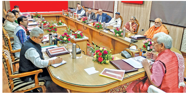
GMK NEWS NETWORK

Inaugurates Pilgrim-Centric Facilities Near Cave Area, Parvati Bhawan