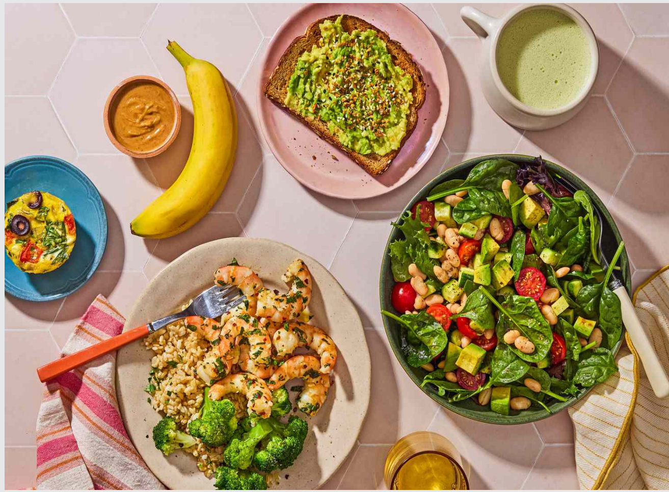
The protein content helps build lean muscle, which in turn boosts metabolism, while probiotics improve gut health, reducing bloating and inflammation that contribute to visceral fat storage. Green tea contains catechins, powerful antioxidants that boost metabolism and increase fat oxidation.

5. Greek yogurt Greek yogurt is high in protein and probiotics, both of which contribute to fat loss.