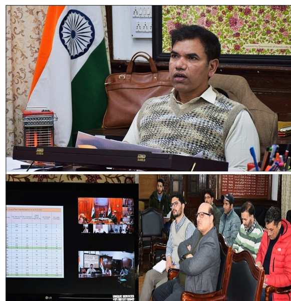
the completion of work on pending blocks.

During the meeting, Div Com reviewed development of transit accommodation towers in each district and directed concerned agency to expedite