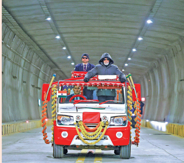
lives, no worker wanted to go home even after we lost seven friends to terrorism. My tribute to those martyrs who gave their ●P-06

SONAMARG: Prime Minister Narendra Modi said on Monday that Kashmir is the crown of the country, and he desires that this crown should shine better and become more glorious in the days to come. The Prime Minister said this after inaugurating and dedicating the Sonamarg tunnel to the nation. PM Modi started his speech by lauding the hard work of the workers who worked to make the Sonamarg tunnel possible and were not deterred from giving the supreme sacrifice. He offered tribute to civilian workers, who laid down their lives during the construction of the tunnel he inaugurated. He said despite the grave danger to their