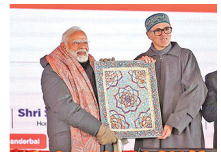
emony of Sonamarg Tunnel in Central Kashmir's Ganderbal district praised ●P-06

SRINAGAR: Chief Minister Omar Abdullah on Monday urged the Prime Minister Narendra Modi to fulfil his promises of restoring the statehood to Jammu and Kashmir. Omar at the inaugural cer-