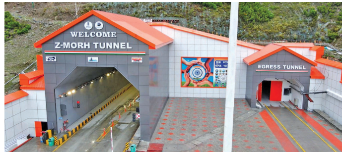
has been inaugurated by our successful Prime Minister Modi, we are very grateful to him. He has especially connected Ladakh, and the people here are very happy. This will benefit us greatly, turning Kashmir's