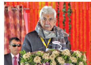
tourism and also create new avenues of livelihood & trade in the region. ●P-06

SONAMARG: The Union Territory Lieutenant Governor, Manoj Sinha said on Monday that Sonamarg tunnel is the lifeline for J&K and it will be a game-changer for the local economy, winter