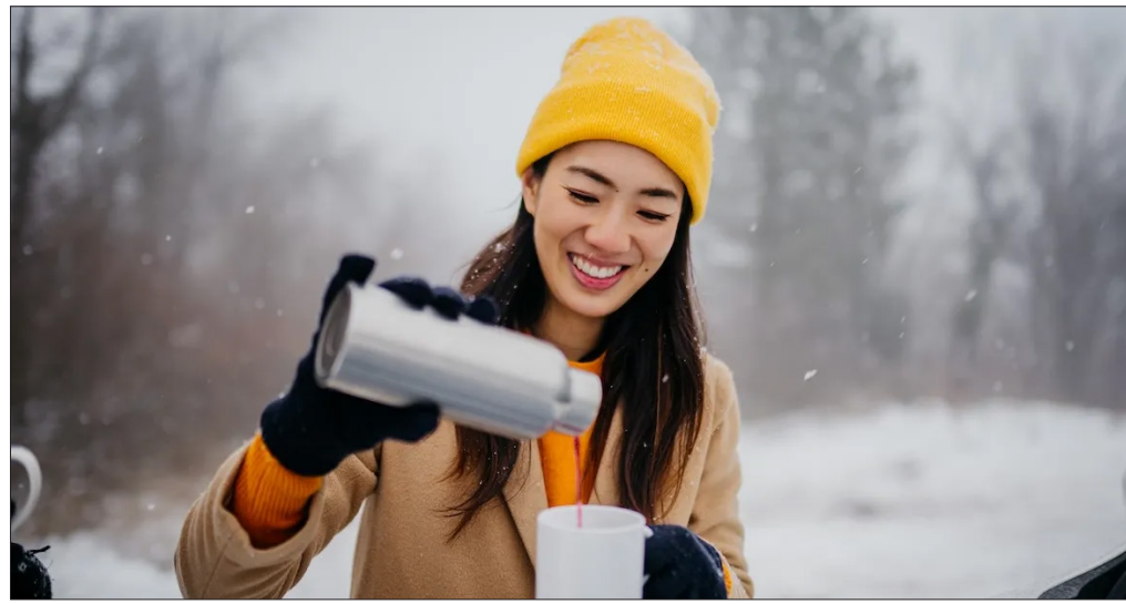
Teas or soups can help you stay hydrated more easily during winter.

Cold weather reduces thirst signals, but staying hydrated is essential for digestion, energy and skin health. Warm herbal