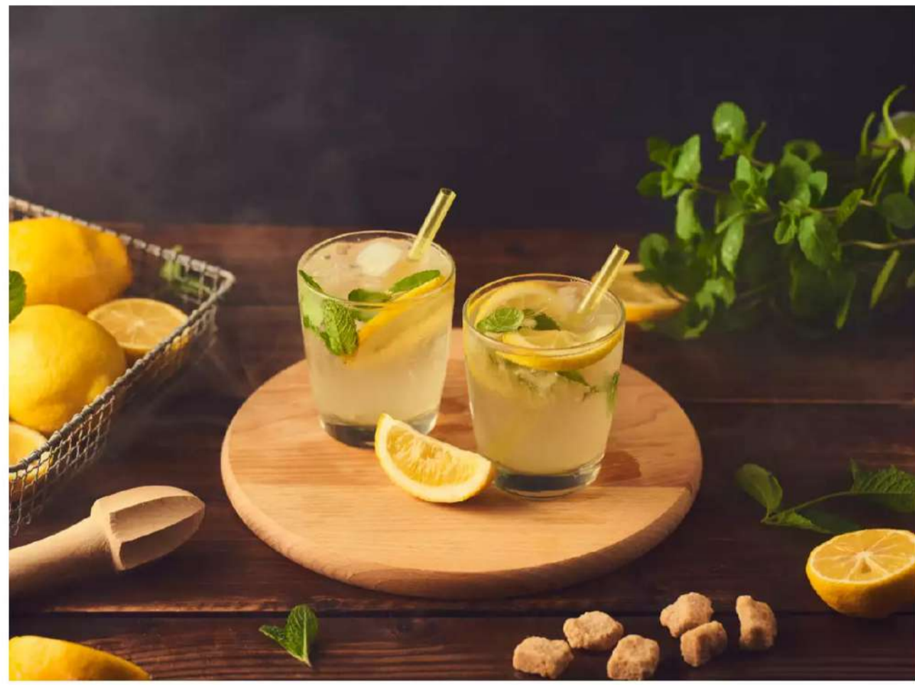
Consuming lemons or lemon water before meals can make you feel fuller, reducing the likelihood of overeating or snacking on unhealthy foods. 7. Promotes hydration Drinking lemon water

6. Curbs appetite The pectin fibre found in lemons can help control hunger and cravings.