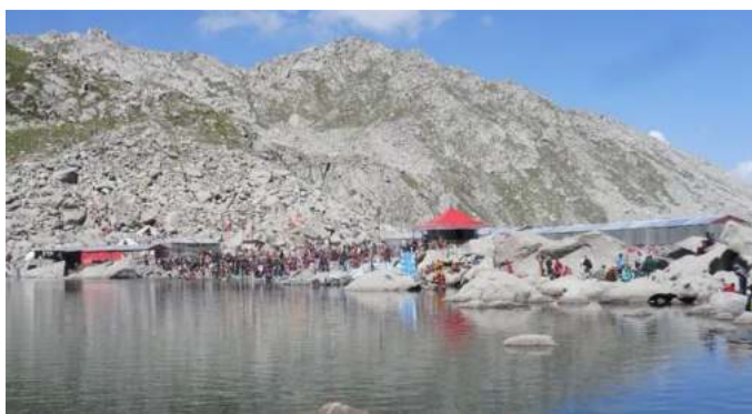
tude Lake shrine of Kailash Kund will begin from Udhampur's Dudu area on August 30," an official said.

The yatra will begin amid threat perception following multiple terror incidents in the Udhampur-Doda mountainous belt in past over the past two months, promoting authorities to increase security in the area. "The yatra to the high-alti-