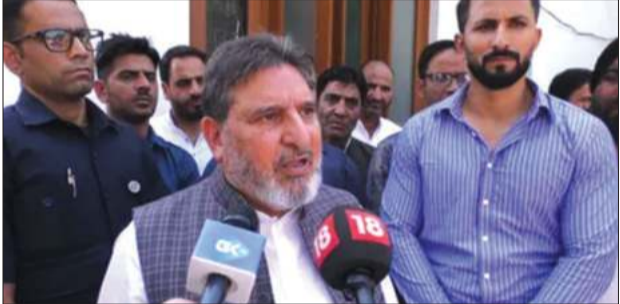
GMK NEWS NETWORK

SRINAGAR: Apni Party president Syed Altaf Bukhari Saturday said that his party will field candidates from 60 seats including 40 in Kashmir and 20 in Jammu for the upcoming assembly elections in Jammu and Kashmir. Talking to the media persons while visiting Chanapo-