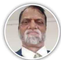
DR. RAJKUMAR SINGH

The Ministry of Women and Child Development (MWCD) is a government department in India responsible for the formulation and administration of rules, regulations, and laws relating to women and child development in the country. Its primary objectives include promoting the welfare and empowerment of women and children, ensuring their safety and well-being, and addressing issues of gender discrimination and inequality. Its key functions include: a. Policy Formulation and Implementation: Developing and implementing policies, plans, and programs for the advancement and empowerment of women and children. Ensuring the implementation of laws and regulations related to women and child welfare. b. Programs and Schemes: Launching and managing various schemes aimed at improving the health, education, and overall well-being of women and children. Providing support for women in difficult circumstances, such as widows, victims of violence, and women in distress.