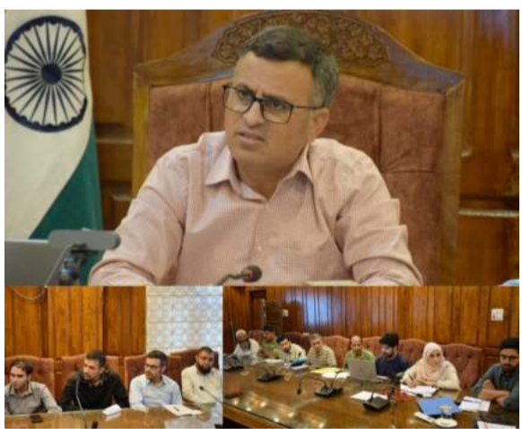
keting Societies, 04 Poultry Co-operative Societies, 4 Dairy Co-operative Societies and 04 other FPOs.

It was given out in the meeting that there are a total of 121 Functional Cooperatives and 29 Functional Cooperative Societies in the district which include 14 PACS (Primary Agriculture Credit Societies), 03 Cooperative Mar-