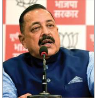
GMK NEWS NETWORK

NEW DELHI: Union minister Jitendra Singh on Friday said that the Kargil War reaffirmed India's constant preparedness to defeat enemy designs and highlighted India's capacity to confront surprises. Addressing the Vijay Diwas celebrations here, he said, "Kargil War victory sent out a powerful message: whenever the integrity and boundaries of India are challenged, the entire nation rises unitedly to face and defeat its adversaries, regardless of the circumstances," said Singh, the Minister of State for Personnel.