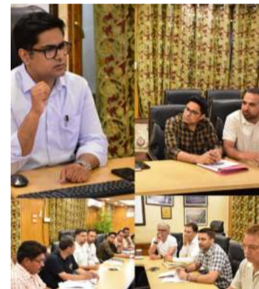
the highest levels of quality and safety standards.

Dr. Owais underscored the role of the new abattoir in enhancing the city's infrastructure and aligning with contemporary standards for sheep and goat slaughter. The upcoming Abattoir is poised to revolutionize modern slaughter practices by emphasizing efficiency and upholding