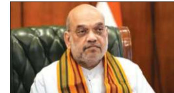
GMK NEWS NETWORK

SRINAGAR: Union Home Minister Amit Shah on Friday said Indian soldiers displayed the ultimate valour in the inaccessible hills of the Himalayas ●P-06