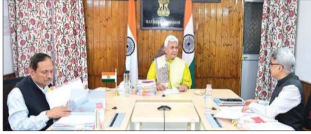
GMK NEWS NETWORK

SRINAGAR: Jammu and Kashmir Administrative Council (AC) on Friday approved amendments in the Jammu and Kashmir Industrial Land Allotment Policy 2021-30. An official said that the Industries and Commerce Department has included views and comments from stakeholders for effectiveness in update of existing policy. He said that amendments have been incorporated to elucidate different clauses of the existing policy with a view to provide simplification of processes and efficiency in land allotments. "While firming up the changes, the Industries and Commerce Department has included views and comments from stakeholders for effectiveness in update of existing policy."