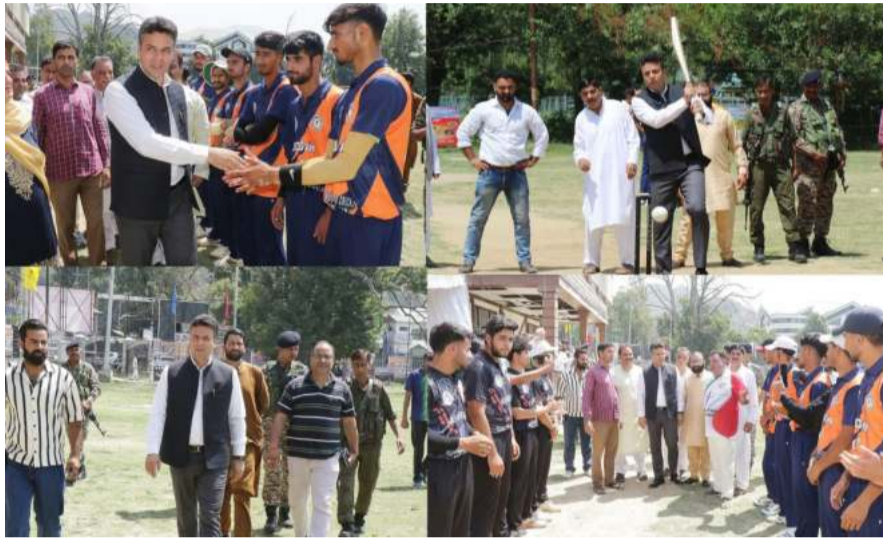
A total of 16 teams are participating in the tournament with the final match to be played on 4th of August, 2024.

Speaking on the occasion, the DC said that there is no alternative to sports, it teaches us a lot many things subconsciously be it group dynamism, communication skills, passion, empathy, etc. In short, it teaches us the value system.