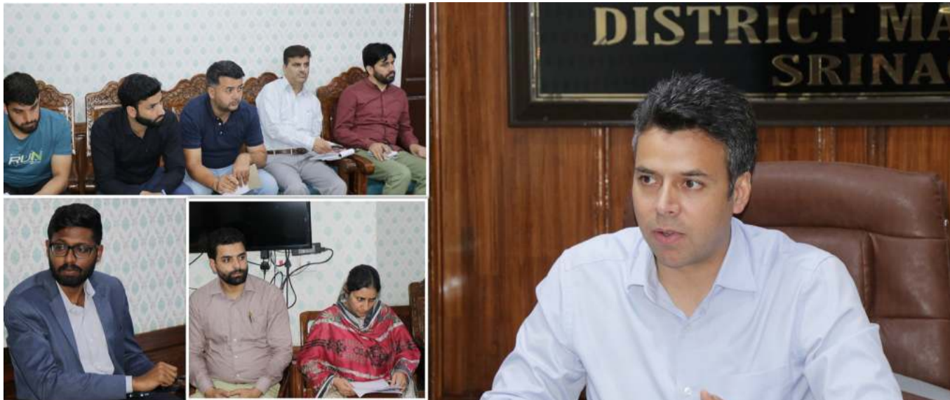
The DC has passed directions to the all line Departments for ensuring all required arrangements to facilitate the mourner's. In addition, several meetings were held in the DC Office Complex with concerned Officers

During the visits the Deputy Commissioner held interaction sessions with the prominent Shia leaders and religious scholars to discuss the arrangements required regarding holy month of Muharram ul Haram.