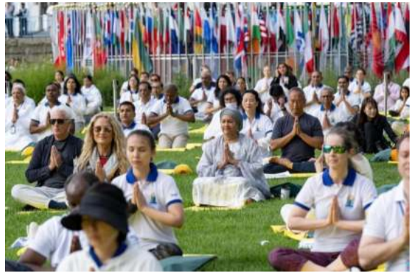
21 as the International Day of Yoga in a resolution proposed by India, cosponsored by 175 countries and adopted unanimously.

The global celebrations with millions participating every year were set in motion by the General Assembly in December 2014 when it declared June