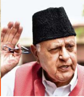
Farooq Abdullah, National Conference president, speaking at a podium.