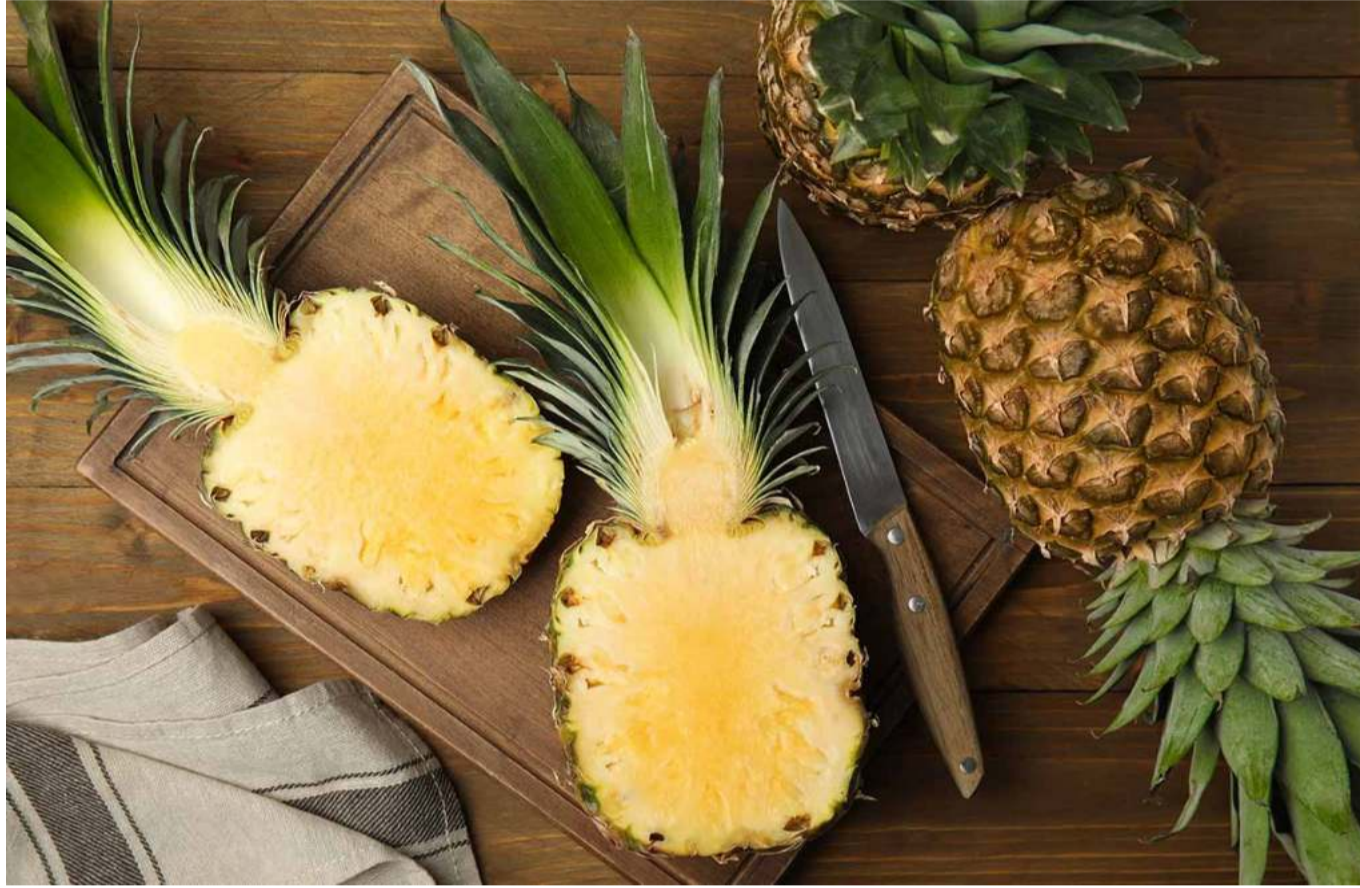
amount of vitamin C, which is an essential nutrient to boost your immunity and keep your body healthy and strong. 3. Aids digestion During the summer months, it is important to

2. Boosts your immunity Due to the hot weather, your body may be prone to infections and illnesses. Pineapples contain a high