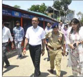
Yatri Niwas serves as the main base camp here for the pilgrims

JAMMU: The main base camp for the Amarnath pilgrims in Jammu capital city is getting a major facelift with the authorities setting a deadline of June 20 for completion of the works, officials said. The 52-day pilgrimage to the 3,880-meter-high cave shrine in south Kashmir is scheduled to start on June 29 and conclude on August 19, they said. The Bhagwati Nagar-based