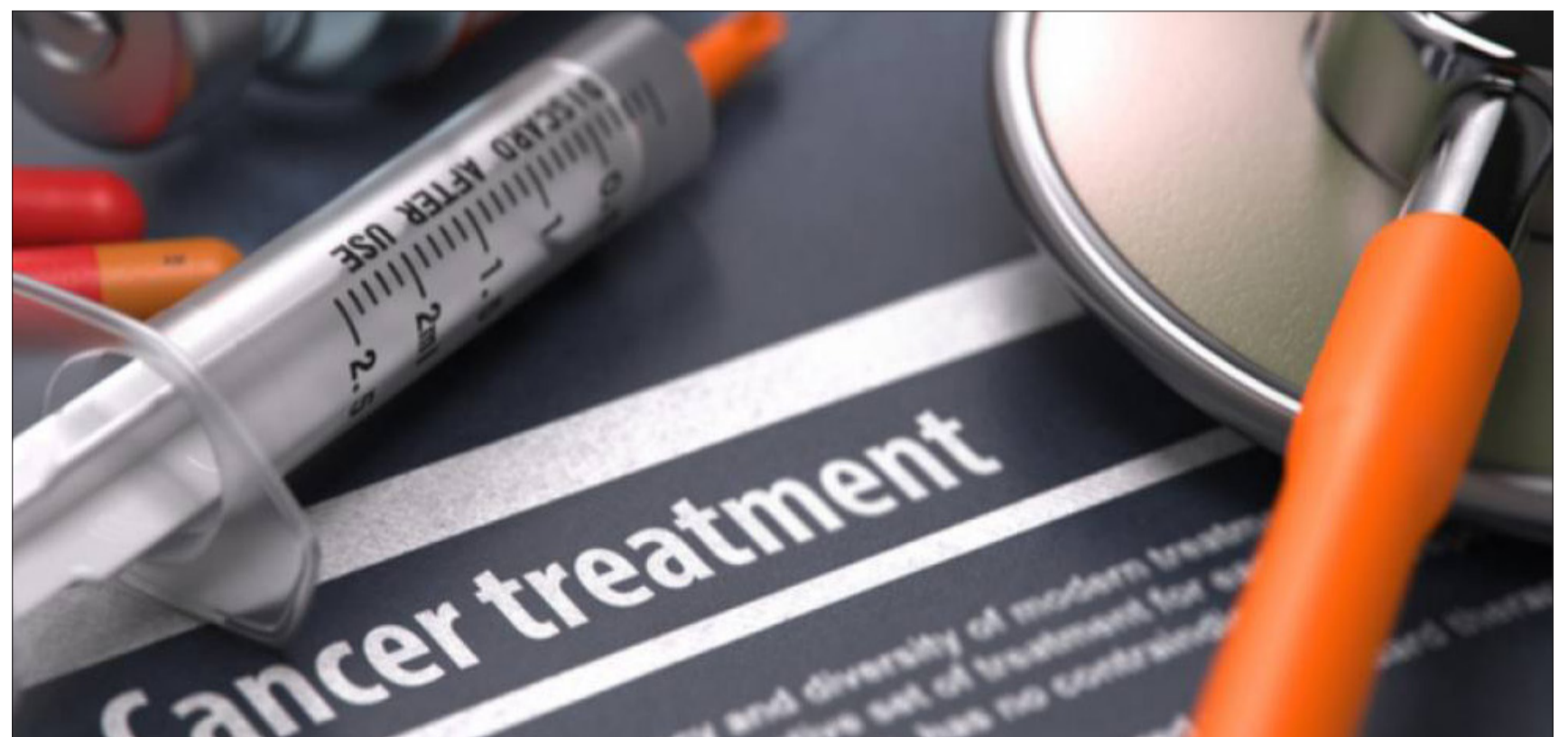
DR RAGHAV KESRI

Stage IV cancer, also known as metastatic cancer, is the most advanced form of the disease. It is characterized by the spread of cancer cells from the primary site to distant parts of the body. Historically, a diagnosis of stage IV cancer was often seen as a terminal condition with limited treatment options. However, recent advancements in medical science have brought new hope to patients and their families. While a complete cure for stage IV cancer remains challenging, treatments such as immunotherapy, targeted therapy, and chemotherapy have shown promising results in controlling the disease and significantly improving patient outcomes.