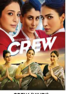
CREW (HINDI) 02:40PM (U/A)