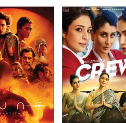
DUNE PART TWO (ENG) 12:40PM (U/A)