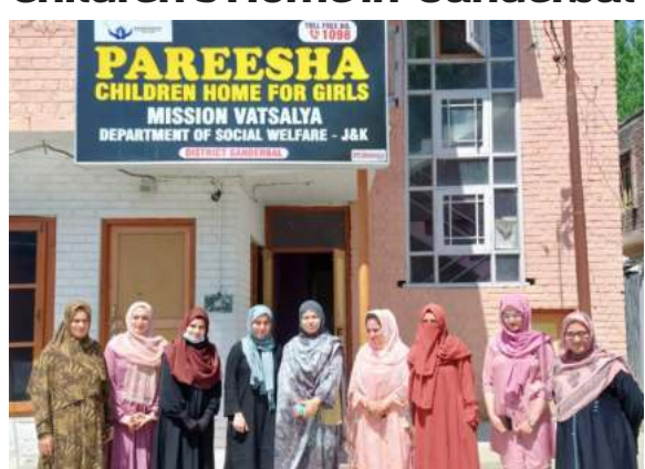
GMK NEWS NETWORK