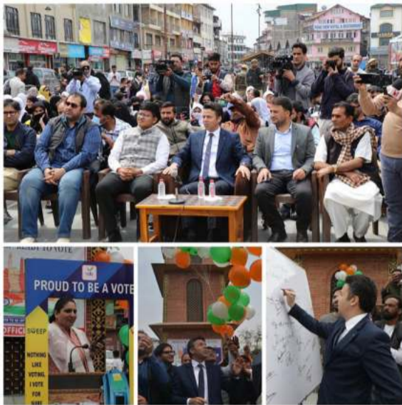
Officer (DEO), Srinagar said that

Speaking on the occasion, the District Election