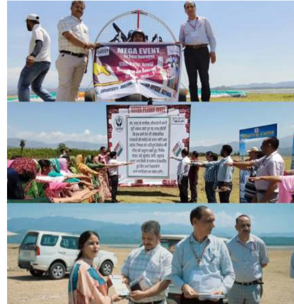
wall served as a reminder for voters not to overlook their duty to vote, a fundamental aspect of India's democratic principles.

The event captured attention of both locals and tourists, who joined Voter Pledge ceremony, marking their commitment to exercising their democratic right. A dedicated