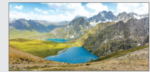
ists, including 3,079 foreigners, exploring the area. Situated in the

GANDERBAL: Sonamarg, a renowned tourist destination in central Kashmir, witnessed a significant increase in visitors in the first three months of this year, with approximately 91,586 tourists,