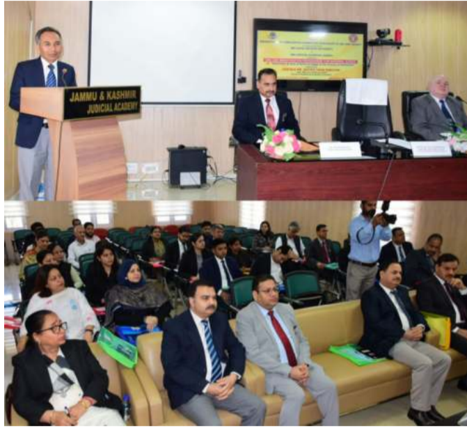
role in promoting the use of mediation as an alternative to traditional litigation and huge responsibility lies on their shoulder to make mediation successful. Referring to the dismal figures of cases referred for mediation by the

Justice Tashi stressed that referral judges play a pivotal