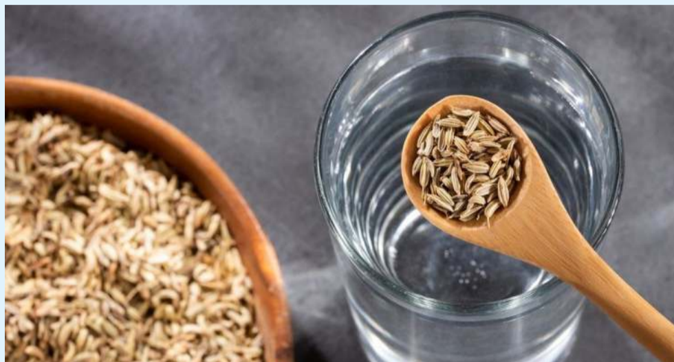
relief from conditions like arthritis or inflammatory bowel diseases.

4. Anti-inflammatory effects Fennel seeds contain anti-inflammatory compounds such as flavonoids and phenolic acids, which can help reduce inflammation in the body, potentially offering