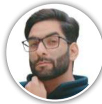
ER AAUSRYF IBN FAROOQ

"Education is the most powerful weapon which you can use to change the world."