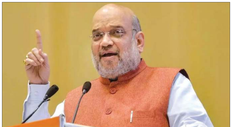
GMK NEWS NETWORK

NEW DELHI: Elections in Jammu and Kashmir will be conducted before September 30, Union Minister Amit Shah said on Wednesday. Speaking at CNN-News18 Rising India Summit 2024 in New Delhi, Shah said, "Voting in Jammu and Kashmir will happen before the Supreme Court of India's deadline of September 30." On December 11, 2023, the apex court directed the Election Commission of India (ECI) to conduct elections in Jammu and Kashmir by September 30, 2024. "We direct that steps shall be taken to conduct elections for the Legislative Assembly of Jammu and Kashmir by September 30, 2024, and statehood shall be restored as soon as possible," the bench said. The last Assembly polls in J&K were held in 2014. The People's Democratic Party (PDP) formed a coalition government with the BJP. But in 2018, the BJP pulled out of the alliance and the government collapsed. Following that, the Assembly was dissolved and the Governor's Rule came into place. On August 5, 2019, the Centre abrogated Article 370 and the erstwhile state was bifurcated into the Union Territories (UTs) of Jammu and Kashmir, and Ladakh. Slamming the opposition, the Union Home Minister, at the summit, also •P-06