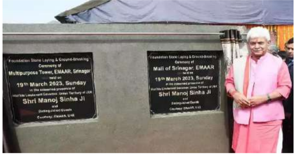
Available, "Mall of Srinagar" will create jobs for 7500 people, thereby becoming the first single mega job creating asset of Jammu and Kashmir.

Documents said that "Mall of Srinagar", is likely to be a state-of-the-art shopping and entertainment destination, with an investment of Rs 250 Cr.