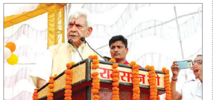
inspiring every citizen to contribute in realizing the vision of Viksit Bharat. The Lt Governor appreciated the College for being in the forefront of setting high •P-02