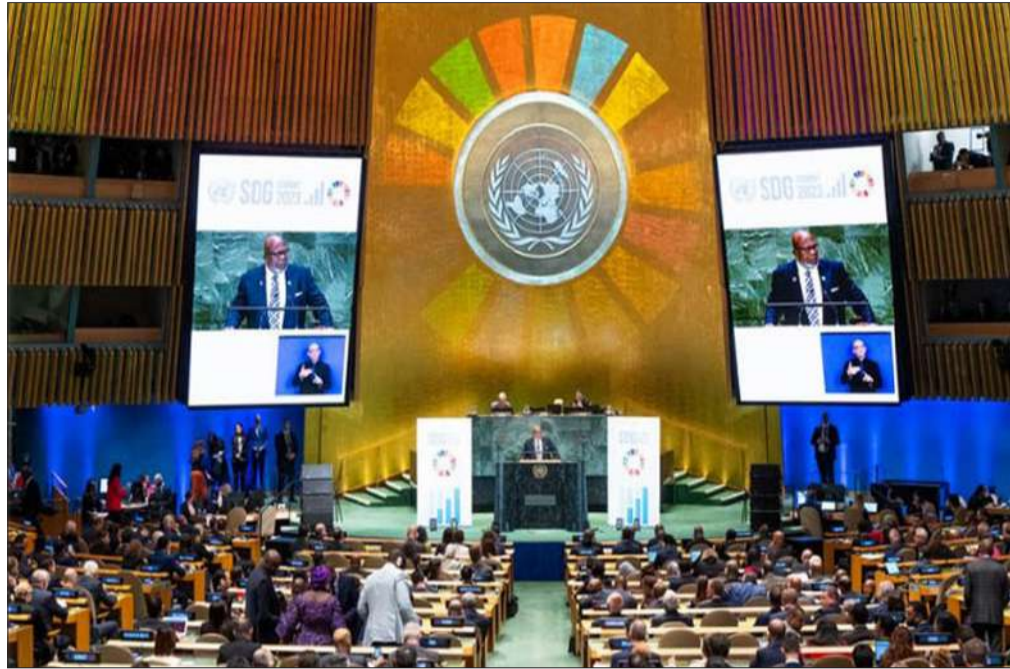
2030 [SDG] Agenda," which he called "a true blueprint for humanity".

General Assembly President Dennis Francis said, "I challenge you all to demonstrate emboldened leadership by using this Summit to announce groundbreaking commitments to support and to complete the