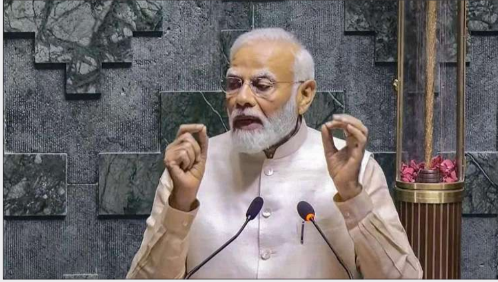
India is brimming with new energy. This new consciousness and new energy can surely turn people's dreams into reality," he said. PM Modi proposed to name

"I had said from the Red Fort that this is the time, and this is the right time to march ahead. Today, India has woken up with a new consciousness.