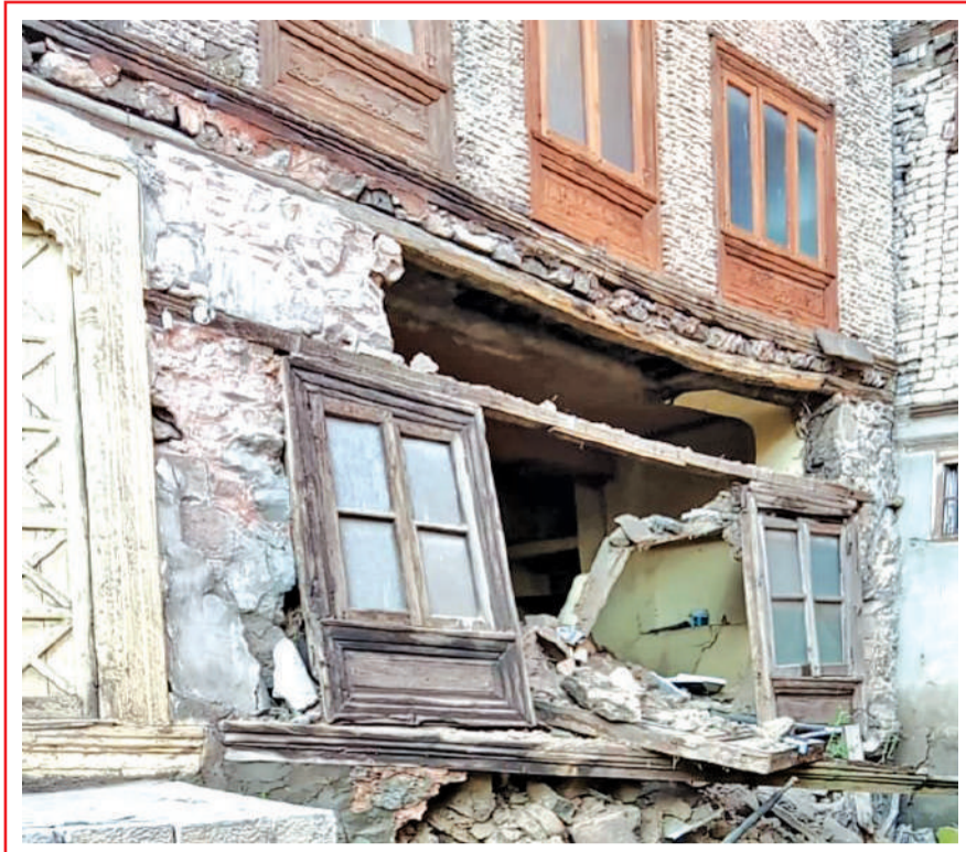
Inviting trouble, anytime can cave in. Residents of Hawal urge authorities to stop any tragedy.

The event was a true celebration of the rich cultural heritage of the region, and its success has paved the way for hosting more such events in the future. The Academy's efforts towards promoting art and culture in the region will undoubtedly go a long way in preserving the cultural identity of the Peer Panjal region.