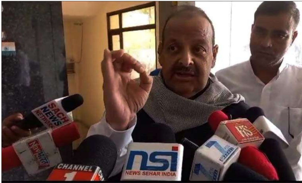
political entities in public space to shun colour blindness and muster the courage to move outside their comfort zones and ask the people associated with tourism and allied industries and they will tell them

about the dividends of peace that has brought cheer in the lives of millions, they kept them deprived of for over three decades as a sinister strategy to remain in the power corridors. Normalised and peaceful Kashmir doesn't fit in with their schemes, which is why they can't conceal their discomfort on seeing the Valley humming with activities round the clock, be it summer or the winter. Never ever has Kashmir witnessed such a tourism and pilgrim boom that is directly associated with the economy of both the regions of Kashmir and Jammu, he added.