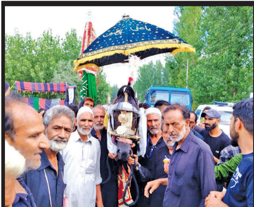
Mourners take out 12th Muharram procession at Sarai Dangerpora, Sumbal in north Kashmir's Bandipora district on Monday.

As part of the campaign, Panch Pran Pledge ceremony was also undertaken by students, Volunteers and other prominent citizens at Sikh War Memorial Baramulla in connection with 'Meri Maati Mera Desh' campaign to affirm the objective to fulfil dream of a developed India in 2047.