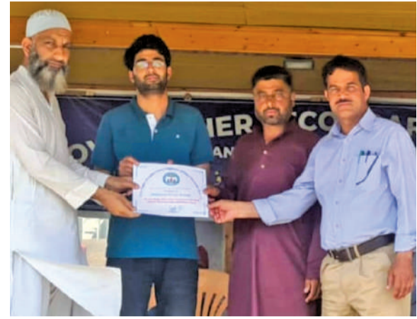
giwacha have once again registered historic success in NEET-2023, which is the

Teachers during the felicitation ceremony said that students of HSS Dan-