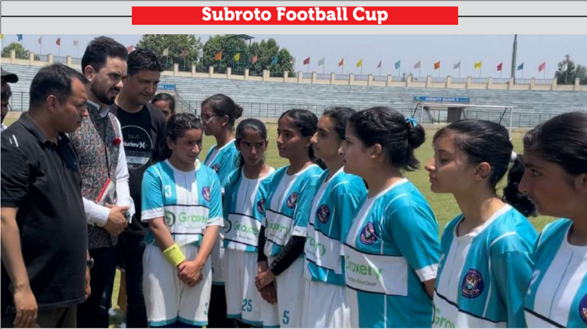
Subroto Football Cup