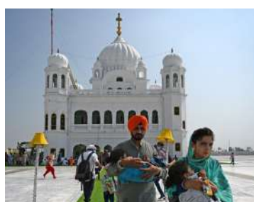
munity, Vaishali Sharma writes.

Furthermore, Pakistani society's patriarchal nature continues to impede women's autonomy, limiting their access to education, healthcare, and decision-making. Furthermore, forced marriages and honour killings are still widespread, with families pressuring women to marry within the com-