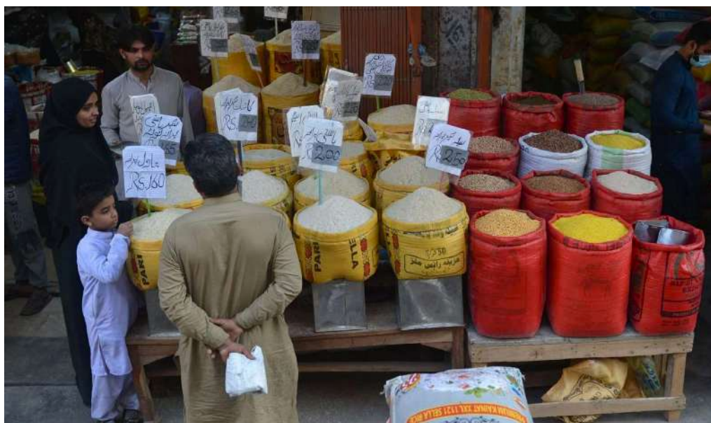
stan PM Imran Khan's arrest Imran Khan and the "subsequent civil unrest have added

Catastrophic floods in 2022, partly overlapping the timing of Gallup's fieldwork in Pakistan also caused an estimated USD 15 billion in economic losses. The report said that former Paki-